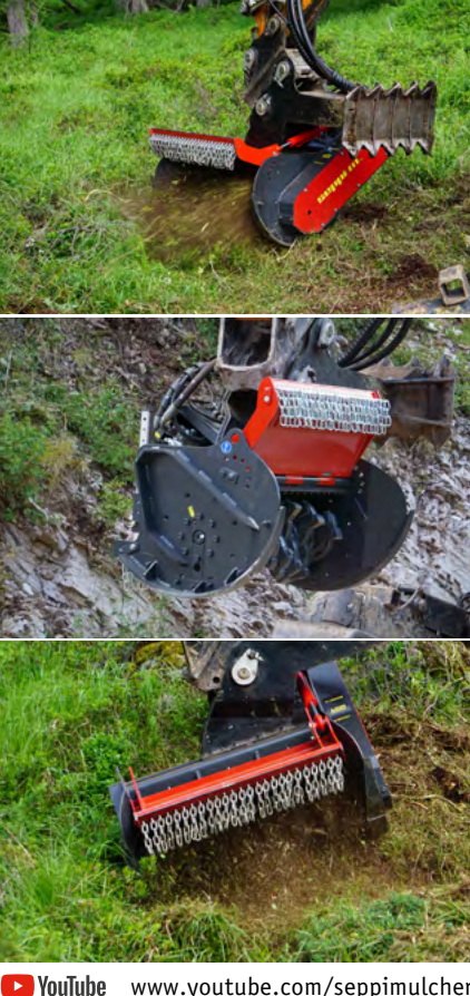
☑ YouTube www.youtube.com/seppimulcher